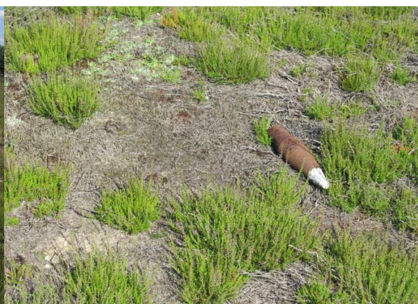
Photo 11 Heath undergrowth regenerating after having been mown. "Diabelskie Pustacie" Reserve in Western Pomerania