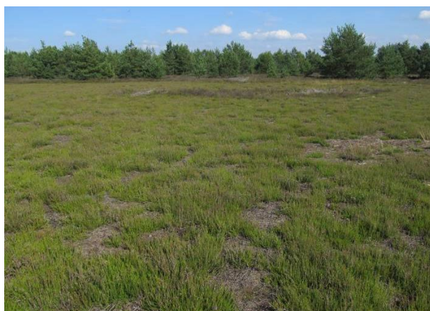
Photo 10 Common heather Calluna vulgaris regenerating on the heathland after having been mown. "Diabelskie Pustacie" Reserve in Western Pomerania