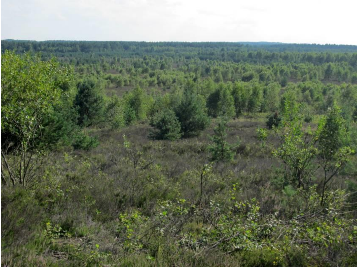
Photo 3 The former military training grounds near Borne-Sulinowo is gradually being overgrown by trees