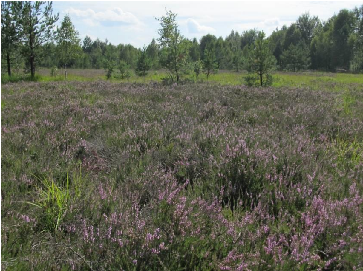
Photo 1 Heathland in the "Diabelskie Pustacie" Reserve in Western Pomerania