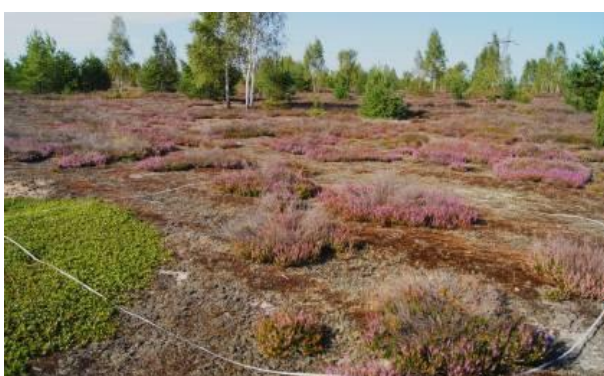
Photo 6 A bearberry heath on the Lucynowsko-Mostowieckie Dunes