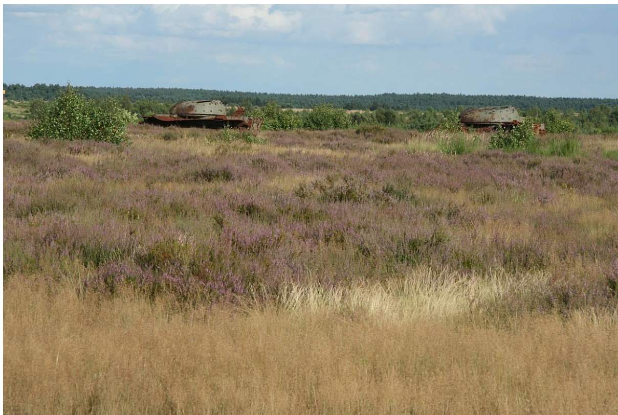
Photo 2 Heaths on the military training grounds near Drawsko Pomorskie

Heaths come in a wide variety of forms – from natural heaths, usually growing in small patches in clearings in pine forests, semi-natural, taking the form of small strips and patches on the outskirts of pine forests and species-poor oak forests, through to anthropogenic vast heaths on military training grounds.