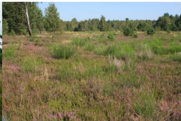
Photo 5 Heaths in the forest complex known as the Red Wood (Czerwony Bór) near Łomża – former military training grounds