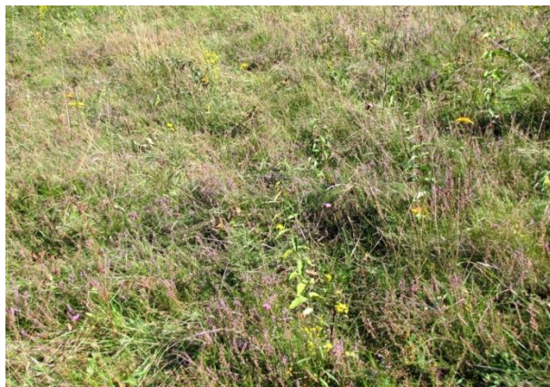
Photo 8 "Flowery heath" undergrowth in the Oder River valley near Krajnik

In all types of heaths, there may be single and scattered species of trees and bushes, mostly Scots pine Pinus sylvestris , warty birch Betula pendula and common broom Sarothamnus scoparius . If these species are present in larger quantities, it is a sign that a heathland is turning into a woodland.