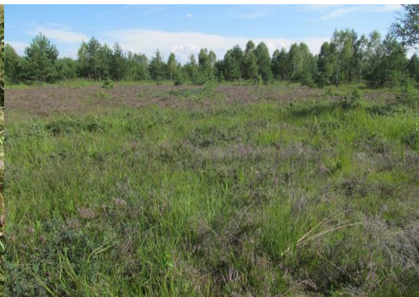
Photo 9 Wet heath undergrowth with purple moor-grass Molinia coerulea and bog blueberry Vaccinium uliginosum in the "Diabelskie Pustacie" Reserve in Western Pomerania