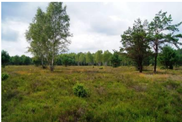
Photo 4 The Niepust heathland in the Kampinos Forest is being recolonised by trees